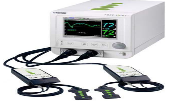
Fig.4 FORE-SIGHT Cerebral Oximeter(27)