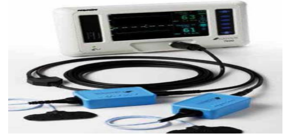
Fig.5 CerOx Cerebral Oximeter(28)