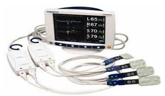
Fig. 3 INVOS Cerebral Oximeter(27)

Although all commercially available cerebral oximeters use same components but there appears to be some difference in approach between these devices. Each device employs different light sources (LEDs vs Lasers), different numbers of wavelengths and different computational algorithms but all with the same goal of most accurately determining SctO_2 values in the cerebral tissue. Based on the distribution of arterial and venous blood in the brain tissue, SctO_2 is calculated according to a ratio of the arterial to venous saturation.