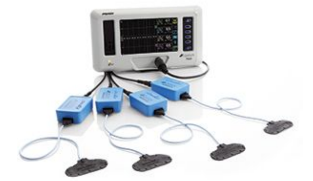
Fig.6 EQUANOX Cerebral Oximeter(28)